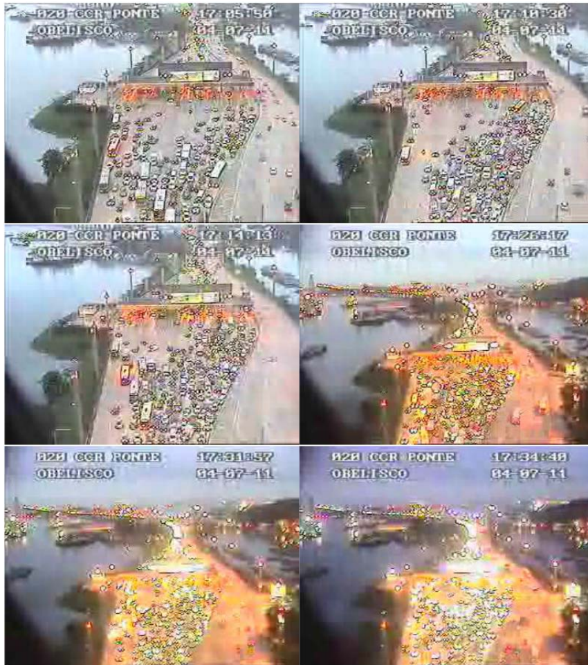
Figure 2: Typical toll booth congestion build up in 30 minutes duration (Jain, Sharma, & Subramanian, 2012)