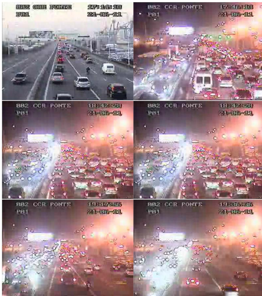
Figure 1: Traffic at 5.15 pm at a road in Rio de Jeniero Brazil, showing no congestion in the first top picture. Shots of 2-hour long traffic jam in the oncoming lanes starting just five minutes after the first picture was taken. (Jain, Sharma, & Subramanian, 2012)

cited according to which the three most congested countries in the world were Thailand, Indonesia and Columbia. Tom Tom Index (Tom, 2017) ranked Mexico City, Bangkok and Jakarta as the three top ranked congested cities. These cities are in developing countries Mexico, Thailand and Indonesia respectively. According to Jain, Sharma, and Subramanian (2012) poorly planned road networks in the developing countries resulted in the presence of small areas as the hot spot of congestion with elongated traffic jams. A simple automated image processing mechanism was proposed, in which, congestion levels in road traffic are detected by processing CCTV camera image feeds. The algorithm is specifically designed for noisy traffic feeds with poor image quality. Local congestion decontrol mechanisms were tested and validated in simulation studies. The authors presented some images of traffic congestion in Rio de Janeiro, Brazil, which are reproduced here in Fig 1. Within five minutes of no congestion observed at 5.15 pm congestion started to build up and lasted till 7.35 pm. When congestion sets in, the reduction in road capacity builds up the congestion further to long delays. A typical toll booth congestion build-up is shown in Fig 2. A smooth traffic input was given here. The congestion built up within 30 minutes despite controlled flow input was provided. Thus, controlled flow input may not be very effective in checking the rapid build-up of congestion.